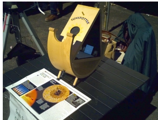
BCAAS Sunspot Viewing Telescope

You can also check the website to find out about upcoming meetings and public events.