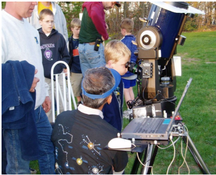
Scouts enjoying a view of the Sun. A special filter on the telescope allows safe observation of the Sun.

The Society has provided communities all over Berks County and the surrounding area with free public events and services such as star parties, planet watches, eclipse viewings, and presentations for school, scout and other community groups.